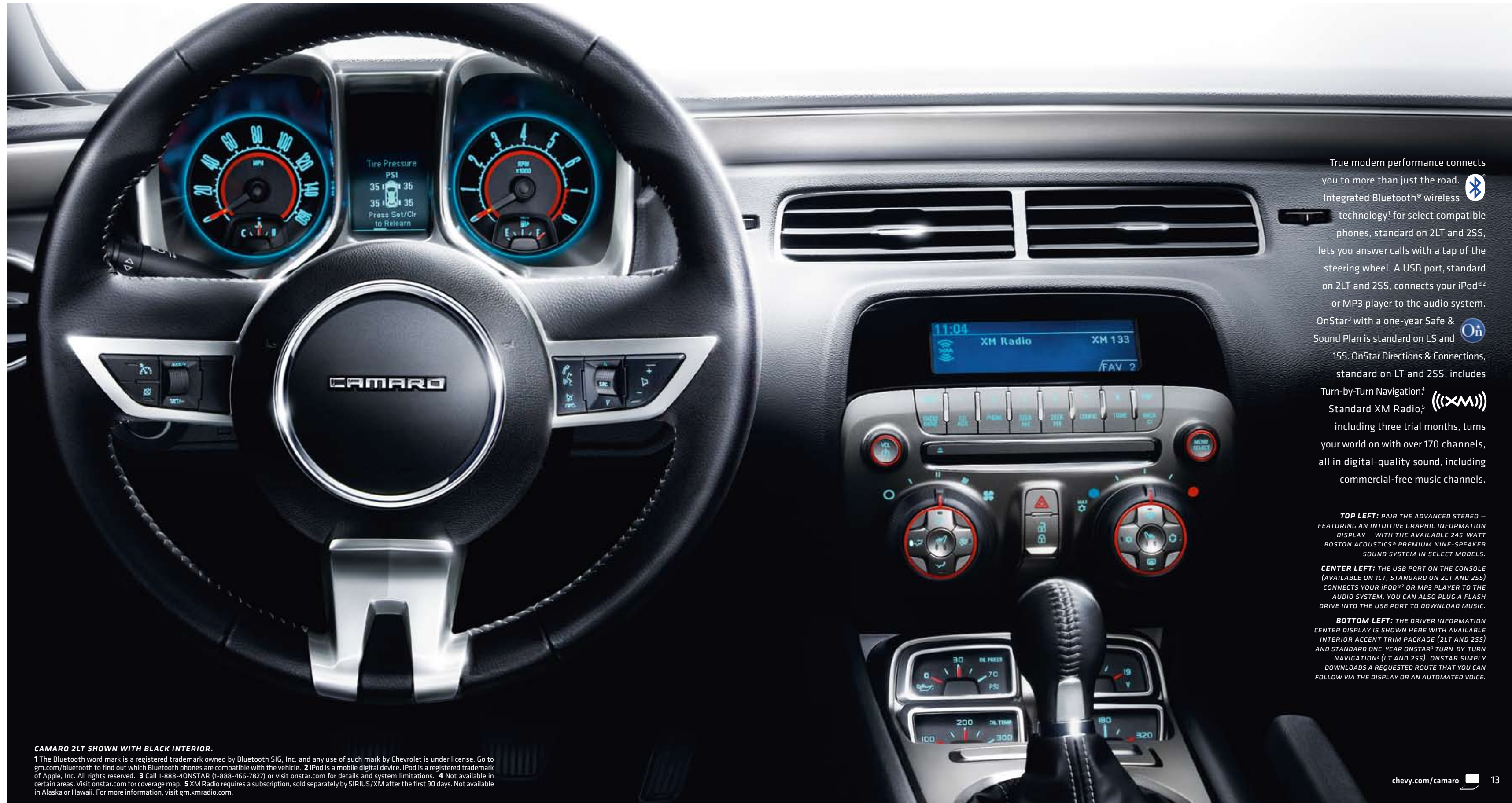
CAMARO 2LT SHOWN WITH BLACK INTERIOR.

1 The Bluetooth word mark is a registered trademark owned by Bluetooth SIG, Inc. and any use of such mark by Chevrolet is under license. Go to gm.com/bluetooth to find out which Bluetooth phones are compatible with the vehicle. 2 iPod is a mobile digital device. iPod is a registered trademark of Apple, Inc. All rights reserved. 3 Call 1-888-4ONSTAR (1-888-466-7827) or visit onstar.com for details and system limitations. 4 Not available in certain areas. Visit onstar.com for coverage map. 5 XM Radio requires a subscription, sold separately by SIRIUS/XM after the first 90 days. Not available in Alaska or Hawaii. For more information, visit gm.xradio.com .