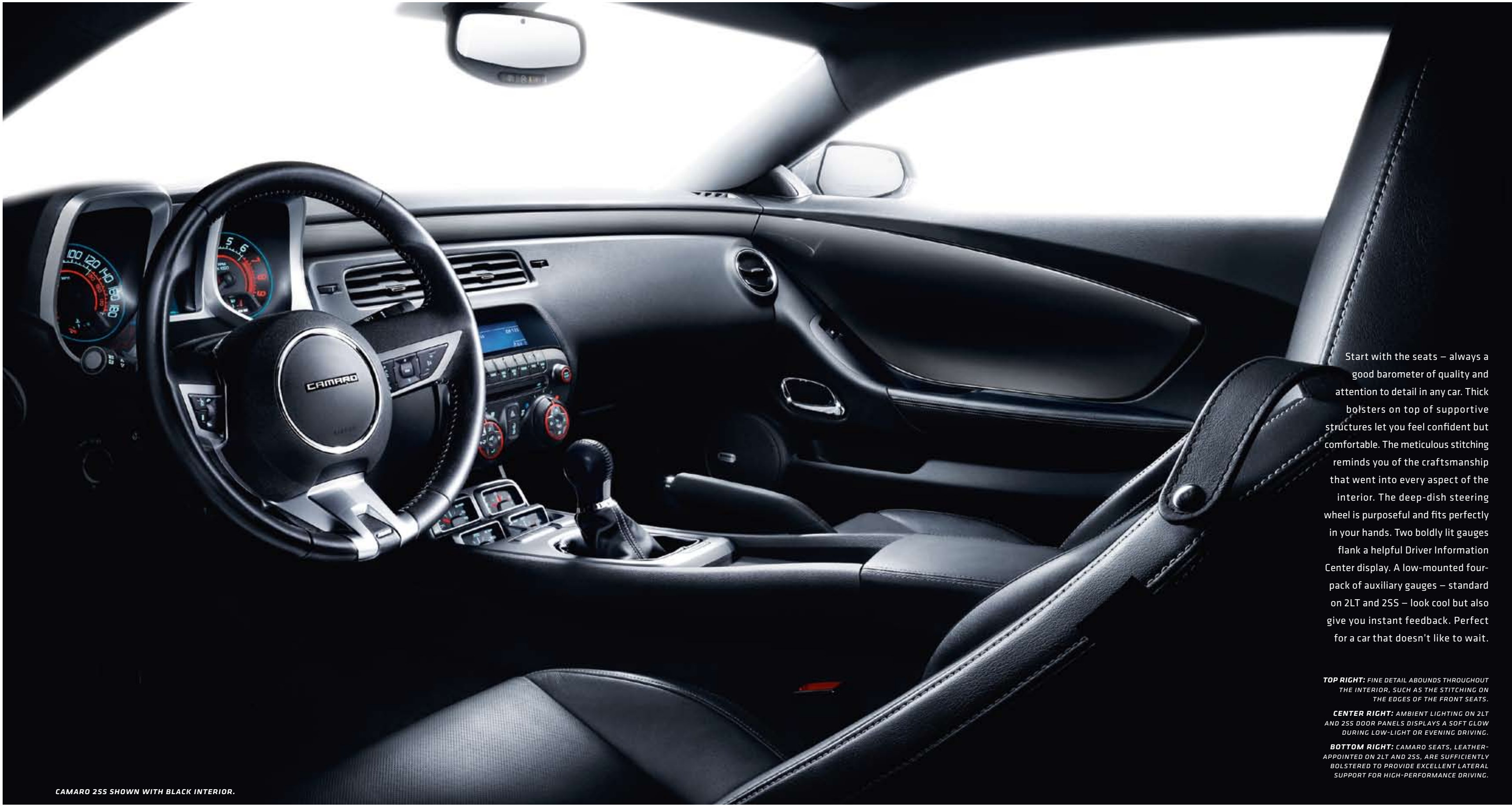
CAMARO 2SS SHOWN WITH BLACK INTERIOR.

Start with the seats – always a good barometer of quality and attention to detail in any car. Thick bolsters on top of supportive structures let you feel confident but comfortable. The meticulous stitching reminds you of the craftsmanship that went into every aspect of the interior. The deep-dish steering wheel is purposeful and fits perfectly in your hands. Two boldly lit gauges flank a helpful Driver Information Center display. A low-mounted four-pack of auxiliary gauges – standard on 2LT and 2SS – look cool but also give you instant feedback. Perfect for a car that doesn't like to wait.